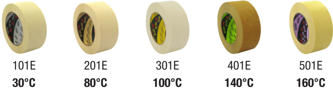
101E 30°C 201E 80°C 301E 100°C 401E 140°C 501E 160°C

Learn more about 3M™ Industrial Masking Tapes at www.3M.co.uk/MaskingMadeSimple or call 0870 60 800 50